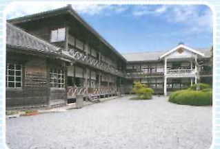
Meiji Village (Tome, Miyagi)